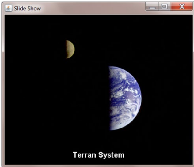
Figure B-3. SlideShow horizontally centers a slide's text near the bottom of the slide